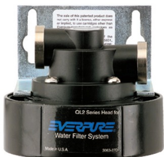
QL2 Single Head: EV9272-18

Filter head exclusively for Everpure replacement cartridges